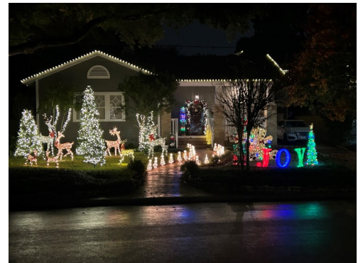
630 Alamo Heights Honorable Mention