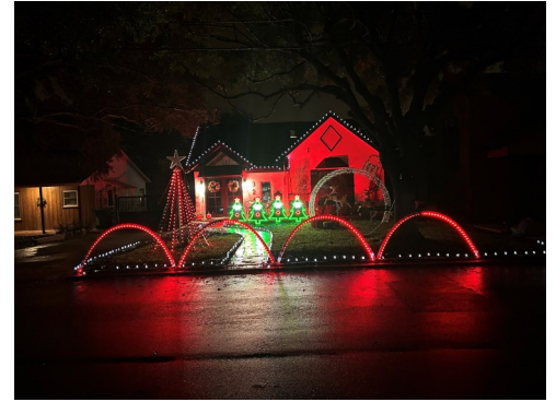
324 Argo 2nd Place