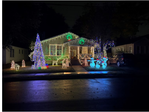
209 Normandy 1st Place