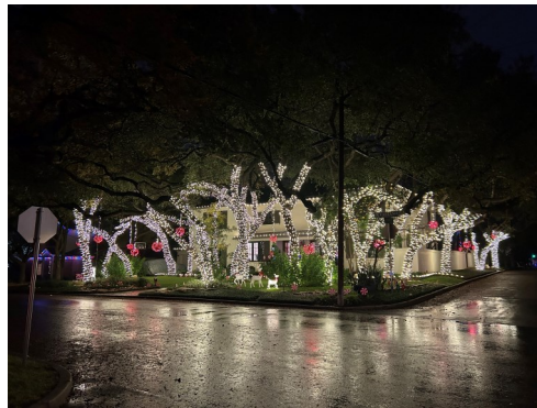
401 Castano 3rd Place